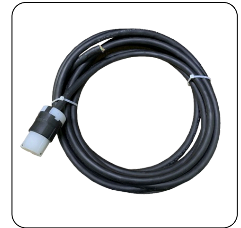
25 FOOT BLACK POWER CORD (220V)