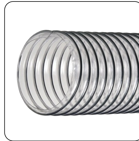
10 INCH X 25 FOOT FLEX HOSE