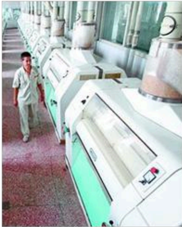
Flour mill access